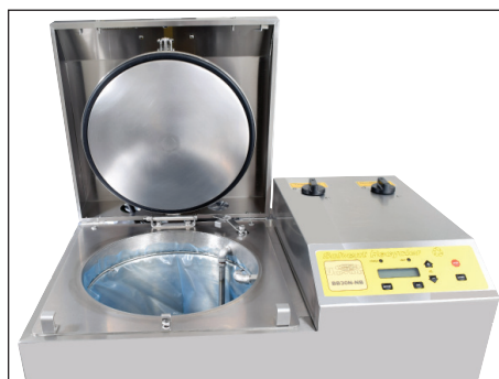
Tank and Lid