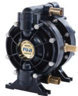
UDP5TA 11.9 GAL/MIN