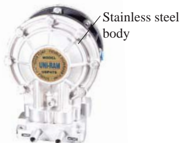
UDP4TSS 3.2 GAL/MIN