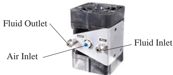
UDP2TAB 1.9 GAL/MIN