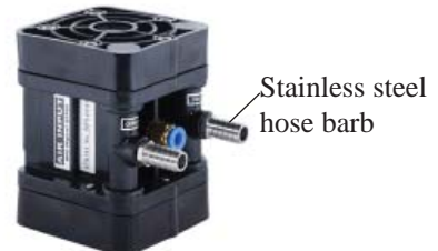
UDP2TS 1.9 GAL/MIN