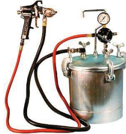
2 1/4 GAL PRESSURE POT AND SPRAY GUN