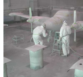
PAINTING AN AIRPLANE USING PRESSURE POT SYSTEM