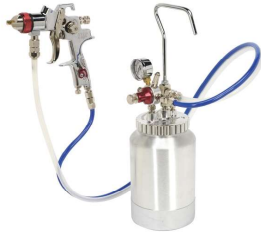
2 L PRESSURE POT AND SPRAY GUN