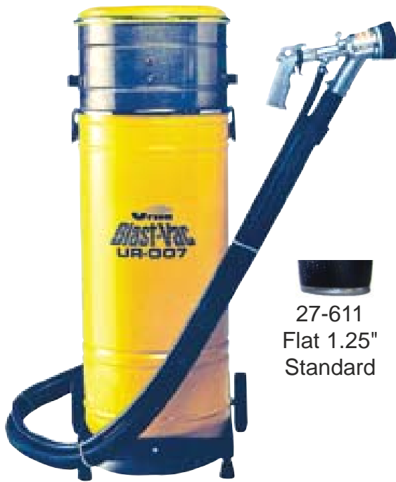
27-611 Flat 1.25" Standard