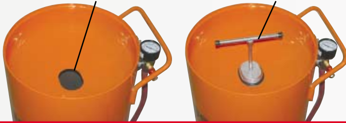
Removable Filler Plug