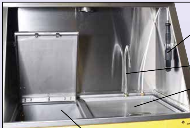
Automatic Wash Tank