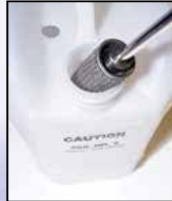
Stainless Steel Inlet Filter