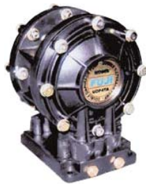
DIAPHRAGM PUMP POWERS the UA400W