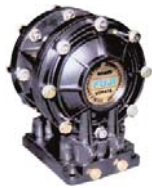
4" DUAL DIAPHRAGM PUMP, 2 CFM