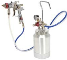
2 L PRESSURE POT AND SPRAY GUN