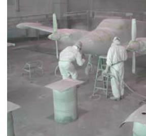
PAINTING AN AIRPLANE USING PRESSURE POT SYSTEM