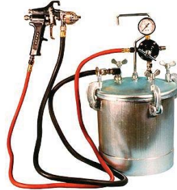
2 1/4 GAL PRESSURE POT AND SPRAY GUN